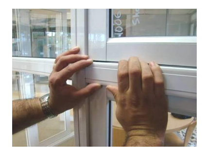
Step 9 SNAP IN BEAD

Secure the winder to the sash with Phillips Head screwdriver. It may be easier to fix the screws if the winder is first removed from the window frame (to improve access to screws).