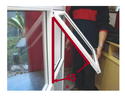
Step 5 POSITION SASH IN OPENING

The Sash must be installed from the outside face of the window. Make sure that the sash hooks (highlighted in picture) are located at the top of the sash and pointing outside.