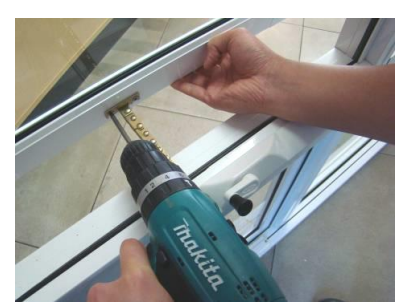
Step 8 FIX WINDER TO SASH

Hook the winder over the two screws on the sash.