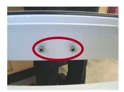
Step 7 ATTACH WINDER TO SASH

Hook the sash into the Head/Transom (indicated in diagram). Make sure that the sash is properly hooked in, before gently lowering the sash and closing the opening.