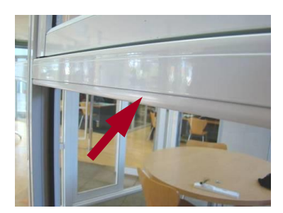
Step 2 UN-SNAP BEAD

Measure the diagonals of the boutique window with a measuring tape. It is important for the correct operation of this product, that the tolerance does not exceed 4mm.