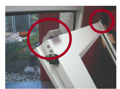
Step 4 ORIENTATE SASH

Once the bead is un-snapped, remove the bead from the window frame.